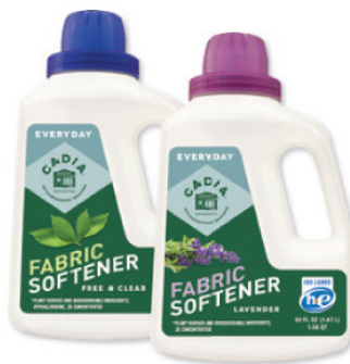
Fabric Softener selected varieties