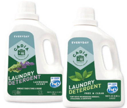
Laundry Detergent selected varieties