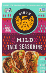
Siete Seasoning selected varieties

Taco Night essentials for the whole familia.