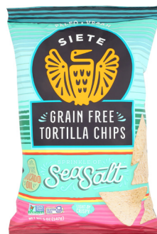
Siete Tortilla Chips selected varieties