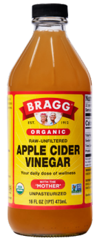
Bragg Organic Apple Cider Vinegar