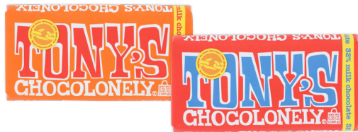
Tony's Chocolonely Chocolate Bar selected varieties