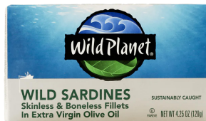
Wild Planet Skinless Boneless Sardines in Olive Oil