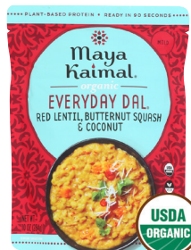
Maya Kaimal Organic Everyday Dal selected varieties