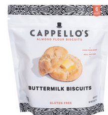
Capello's Gluten-Free Buttermilk Biscuit