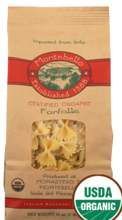
Montebello Organic Artisan Pasta selected varieties