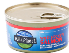
Wild Planet Wild Sockeye Salmon