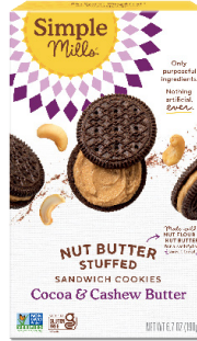
Simple Mills Sandwich Cookies selected varieties