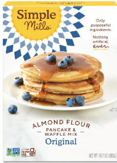
Simple Mills Almond Flour Baking Mix selected varieties