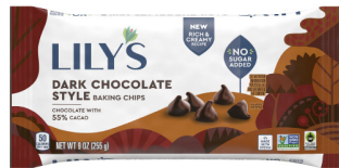
Lily's Chocolate Baking Chips selected varieties

So, we put our heads together and reinvented how you treat yourself by crafting delicious, drool-worthy sweets that don't need any added sugar. Is it magic? Nope, that's LILY'S.