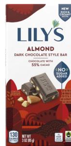
Lily's Chocolate Bar selected varieties