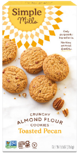
Simple Mills Cookies selected varieties