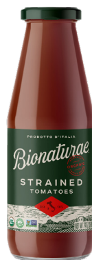
Bionaturae Organic Strained Tomatoes