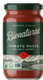
Bionaturae Organic Tomato Paste

Our updated packaging pays homage to our rich heritage. At Bionaturae, authentic Italian means more than food that comes from Italy. It's an attachment to traditions and quality. It's organic ingredients that represent the heart & soul of an Italian kitchen. Welcome to our big Italian table.